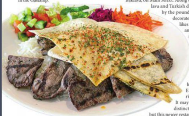
Grilled lamb at the newly-returned-to-El Cajon Sultan Mediterranean Grill.

Now, Sultan's baklava bakery and coffee shop makes an instant impression with vivid